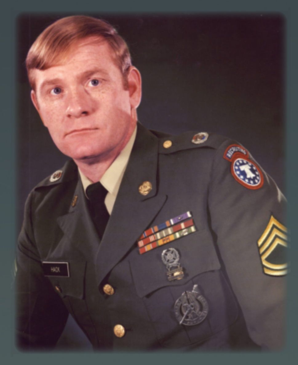
Based on the life of SGT. HACK