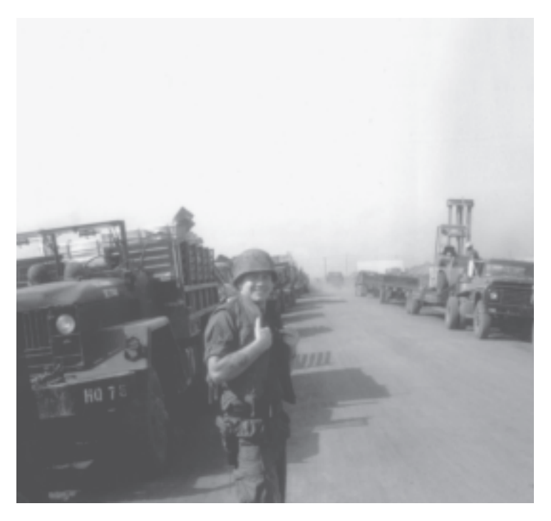
Highway 13, Outside of Lai Khe