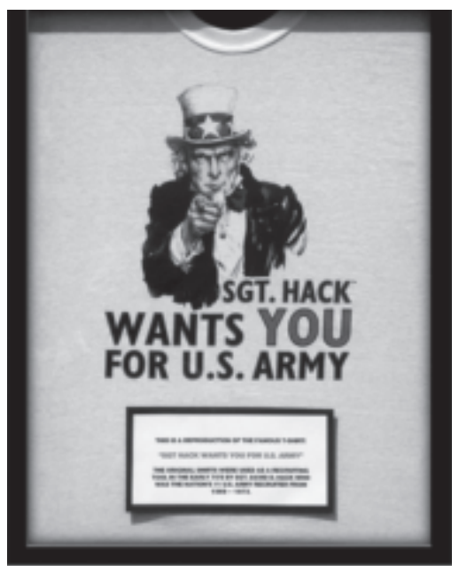
A framed "Sigl. Hack Wants You" I-shirt displayed with the "Hackmobile" inep.